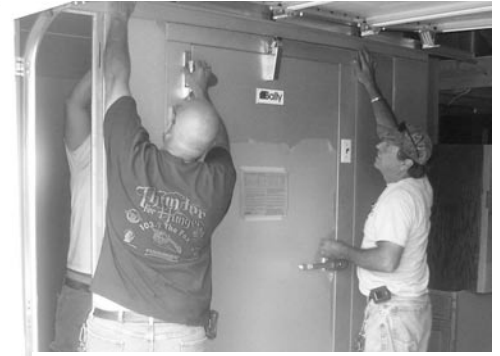
Installing New Walk-in-Freezer

The freezer required a new 220 electrical line that was installed by one of our quality volunteers and we are thankful to have this addition to the mission. We are looking forward to additional opportunities to serve the community in ways that will have a more lasting impact on their lives. We give them food and clothing and eventually they are back for additional help. If we can help them find jobs or arrange for training for jobs we can help them improve their life significantly. This happened to a young woman who came to the mission and I kept a watch for help wanted signs and kept telling her to check them out. Now she is working and paying her rent and taking care of her own needs. We also have friends that come to us with addiction problems and we refer them to places where they can find the help they need. One of the most important referrals we can make is to a life given over to our Lord Jesus Christ.