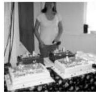
The Cake Ladies supply special Easter Cakes for the dinner.

This is a great day for the kids and I know if you are a part of it you will go home blessed for your effort. If you want to volunteer please call and leave a message at (810) 767-5312 so I have a count of volunteers. We also can use about 4 people to come in at the end to help with final clean up and set-up for Sunday Services.